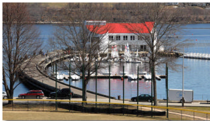
Boathouse at the USCG Academy

bountiful buffet was catered by Flanders Fish Market & Restaurant of East Lyme. They featured as-sorted cheese and crackers along with cold crab dip and fresh vegetable crudité's. For entrees there was a choice of Baked Seafood, Roast Chicken, seasoned to perfection, or London Broil with gorgonzola mushroom sauce. Also, there were plenty of mashed potatoes, salad and